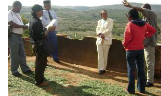
Conducting a stakeholder analysis in Madagascar