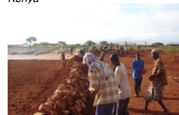
Community members making a water pan to mitigate against drought in Northern Kenya