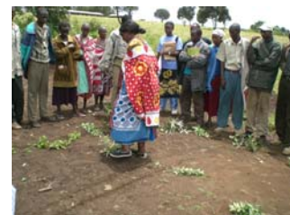
A Maasai woman facilitating a Community Resource Mapping exercise in Narok, Kenya